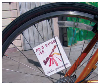
America Meredith, Cherokee Spokespeople , detail

Participants will view and discuss the exhibition and participate in an art activity exploring the ways in which everyday cultural objects like bicycles can inspire creative reflection and community action through artwork.